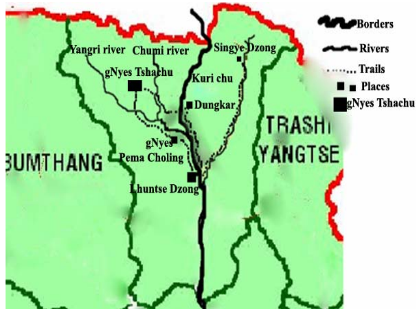
Sketch Map 1. Location and Trails to Kurtoe gNye Tshachu.

The guardian deity of this gNyes is gTer-bdag Zo-ra-ra-skyes . To the south of this gNyes is found the gNyes tshachu (see Photo no. 1). The identification and recognition, as well as the documentation of its history have been reported in as many as three sacred texts. One text gnyes-chen-mkhen-pa-lung-gi-gnyes-yig-mkha-'gro-ye-shis-mtsho-rgyal-gi-shus-lan points out that the revealer of sBas-yul mKhen-pa-ljong gNyes , its hidden treasures and tshachu was prophesized by Khandro Yeshe Tshogyal to be Tertön Pema Lingpa. This prophecy is clearly indicated in one stanza of the prose-poem recorded in the above text. The prophecy is written thus: