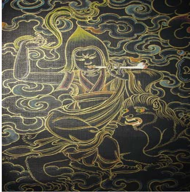
Photo No.3: Painting of gNod-sbyin-rgod-ma-kha, the Guardian Deity of Kurtoe gNyes tshachu

It is believed that he orders fierce and wrathful punishments comprising sudden snow falls and downpours of rain accompanied by abnormally large hailstones, dreadful lightning and thunderbolts aimed at those who have breached